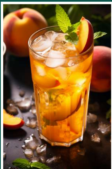
TRÀ ĐÀO CAM SẢ

Have you heard of Coconut Coffee? In Vietnamese we say "Cà Phê Dừa".