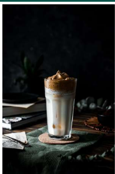
CÀ PHÊ SỮA DỪA